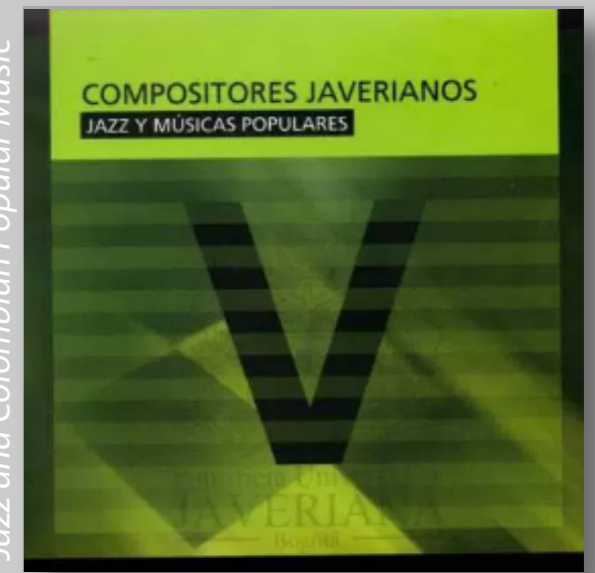
Compositores Javerianos V - Jazz and Colombian Popular Music