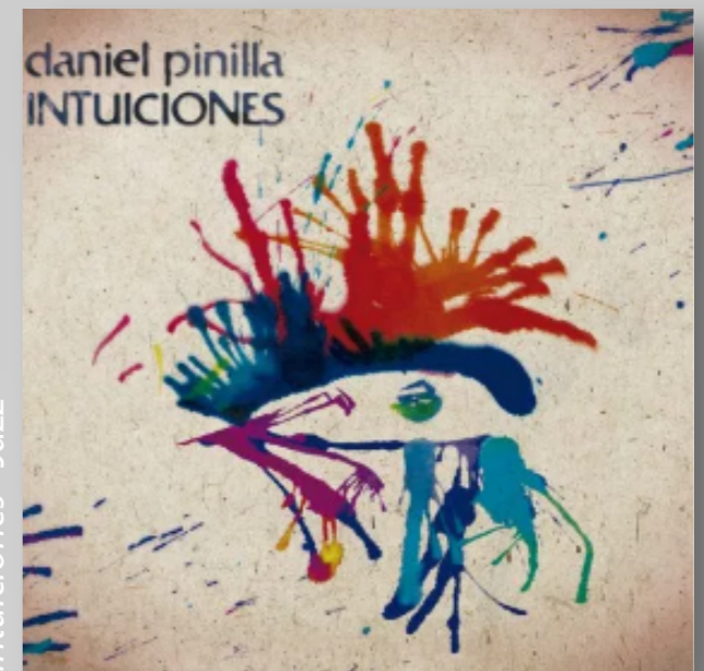
Intuiciones - Jazz