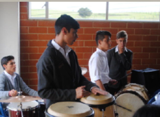
Prueba de sonido con la sección rítmica