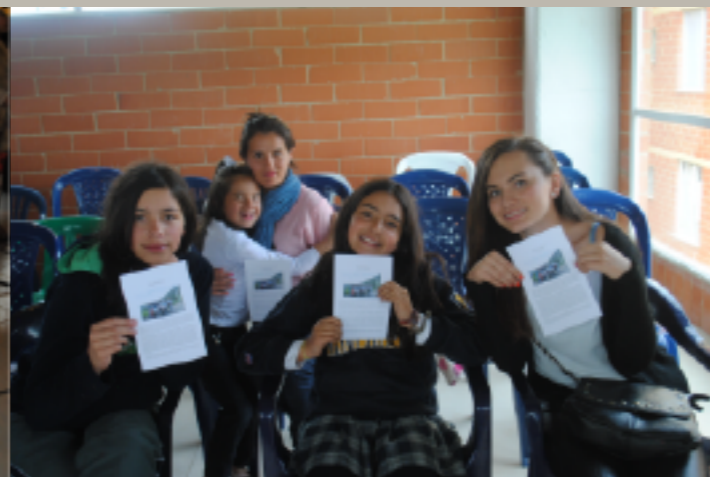
Participantes del taller con el programa de mano del recital