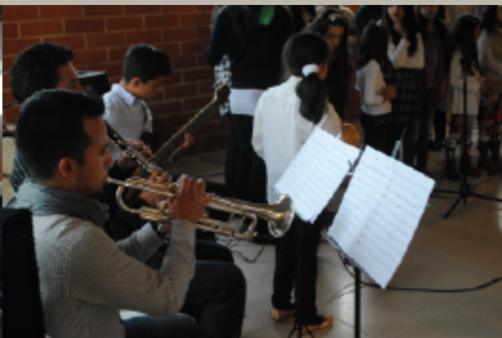
Ensayo con instrumentos de viento para el recital