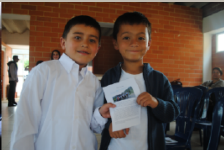
Participantes del taller con el programa de mano del recital