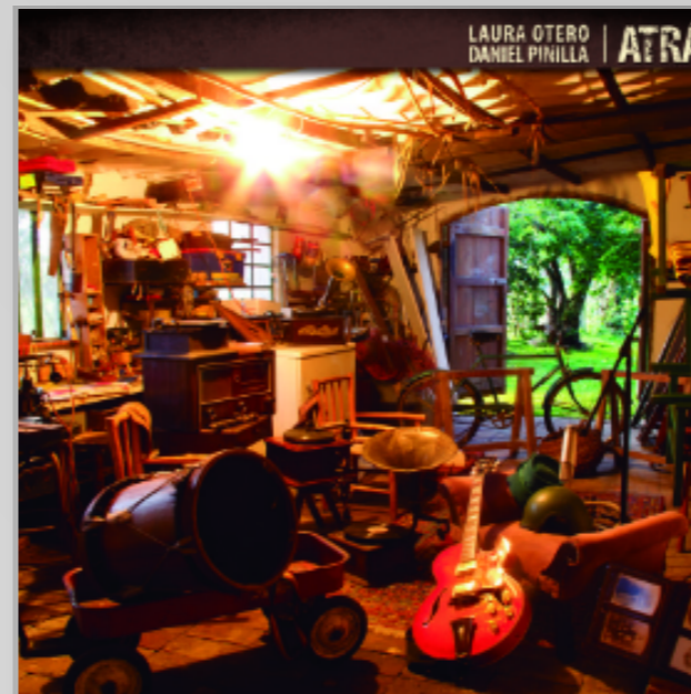
Atrás - Colombian Jazz