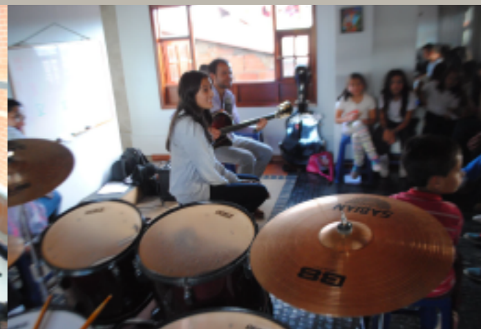
¡Clase de improvisación!